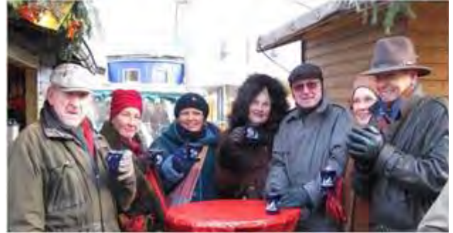
A train ride to the City of Limburg to visit a traditional Christmas Market with hot 'Bratwürst' and 'Glühwein' to keep warm!